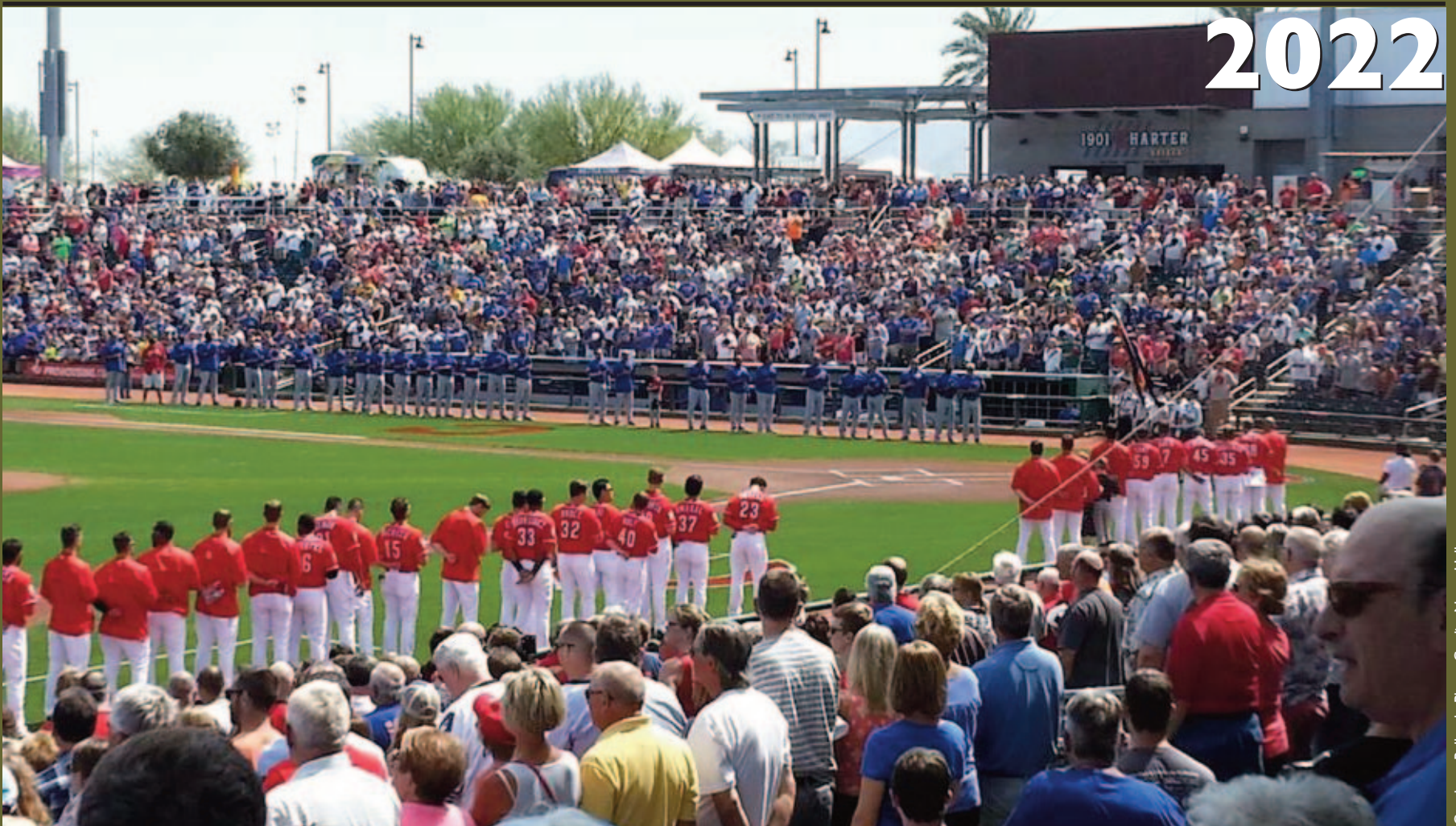
Goodyear Ballpark